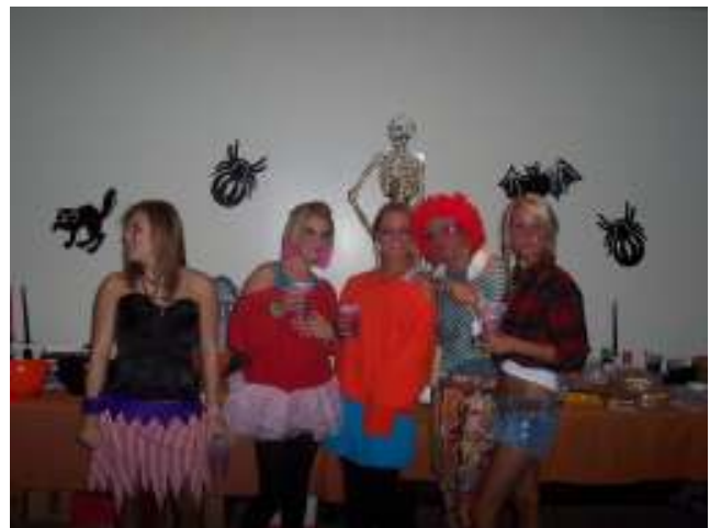
The sexy dance girls.