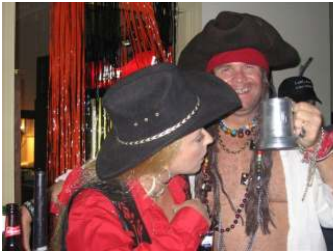
Yo ho ho & a bottle of Rum, Captain Morgan's Parrot Bay Rum that is!!!