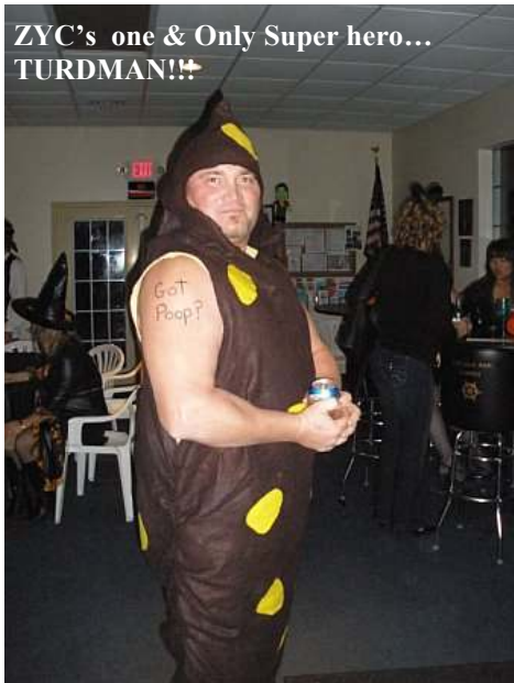
ZYC's one & Only Super hero... TURDMAN!!